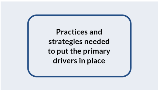
Figure 5. Secondary Drivers

The Change Framework secondary drivers are equally important as the primary drivers in systems change. Secondary drivers are active components of the primary drivers. They specify the necessary conditions and strategies for change (see Figure 5). Secondary drivers are the promising, innovative, and evidence-based practices and strategies that are needed to put the primary drivers in place.