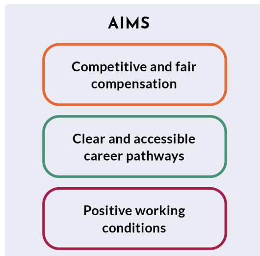
Figure 2. Aims

The ECE Workforce Systems Change Framework (the Change Framework) focuses on three aims for improving conditions for the ECE workforce: competitive and fair compensation, clear and accessible career pathways, and positive working conditions (see Figure 2). 5 These areas represent the most immediate challenges that can be addressed to create good jobs for the ECE workforce. The other two policy areas (workforce data and financial resources) are embedded within each of the three aims as a means to achieve those aims for compensation, career pathways, and working conditions. The following section describes the present challenges and desired changes for each aim.